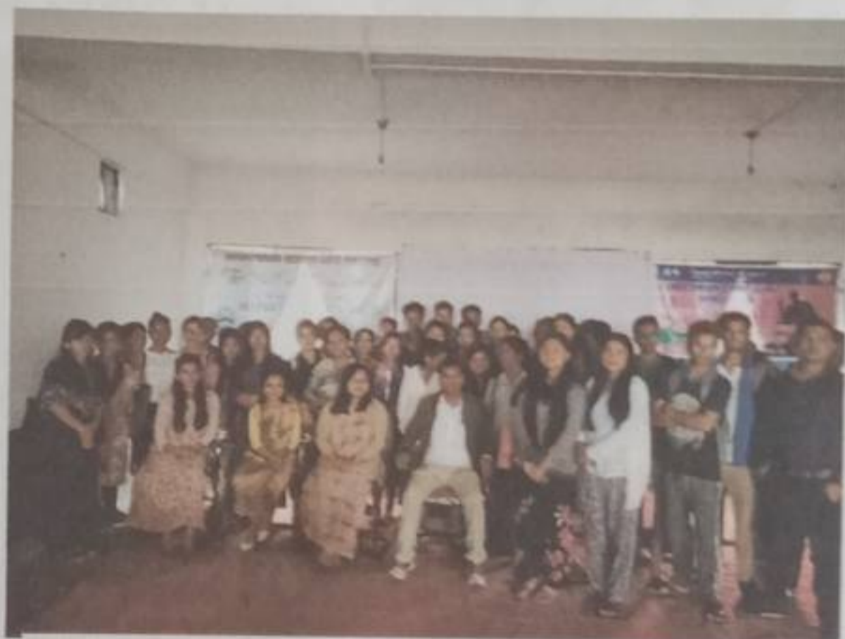
Group Photo after the Film Screening